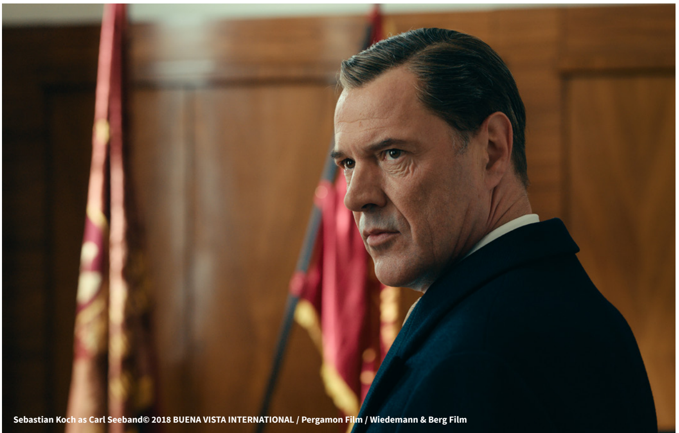
Sebastian Koch as Carl Seeband

Koch appeared together with Bruce Willis in John Moore's A GOOD DAY TO DIE HARD (2013) and for Ridley Scott in his American pilot THE VATICAN (2014).