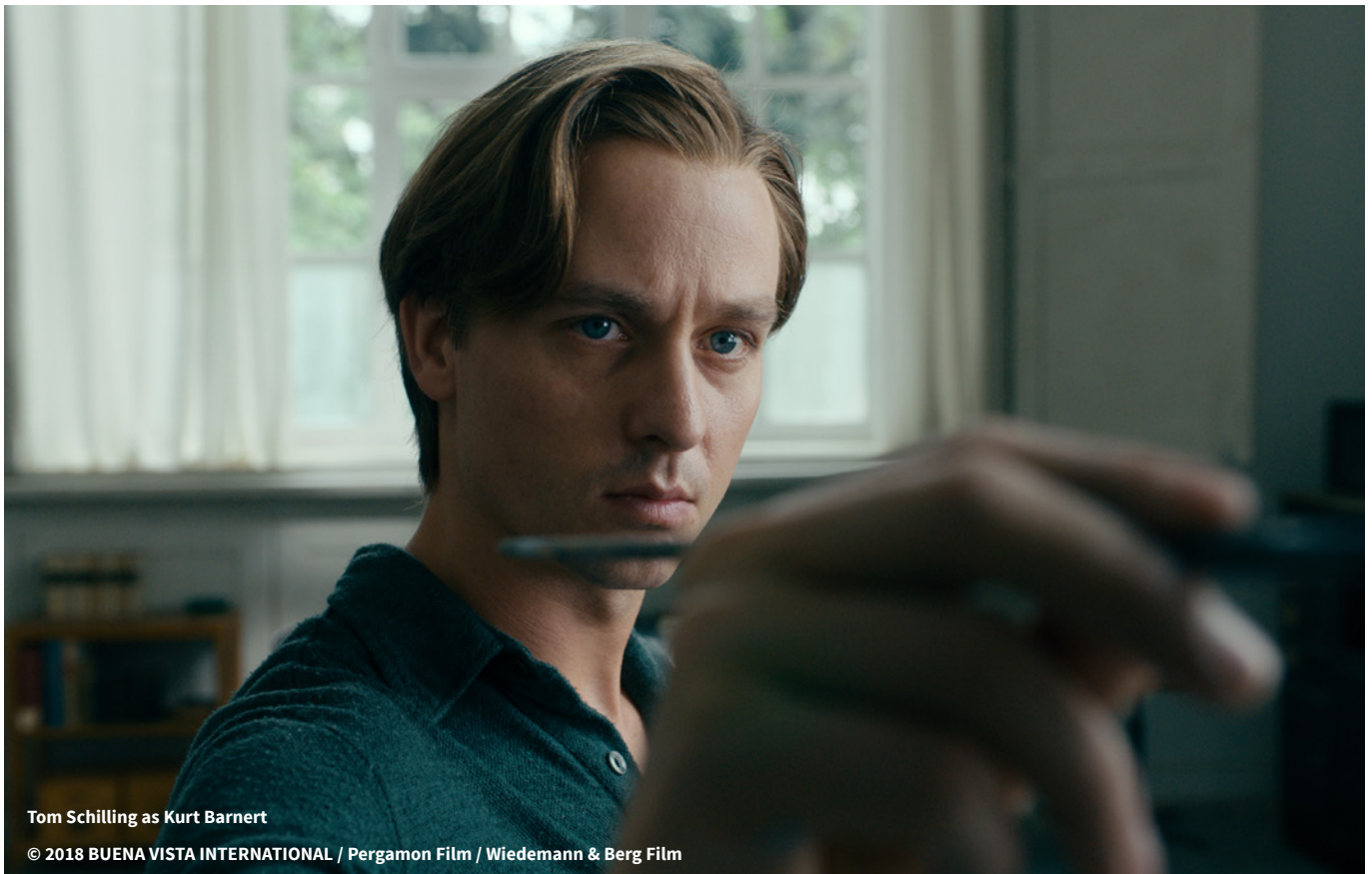
Tom Schilling as Kurt Barnert

The complete antithesis of Kurt Barnert is his father-in-law Professor Carl Seeband, played by Sebastian Koch, who had already featured in the leading role in Henckel von Donnersmarck's Oscar®-winning THE LIVES OF OTHERS, an appearance that launched him to international stardom. The director comments: "The character of Seeband is a dyed-in-the-wool Nazi and witnessed the complete failure of this ideology and how it brought about his country's collapse. He then found safe harbor in the next systems, however, and with his discipline, health, intelligence, and scientific expertise, remains unassailable. It was these qualities that also enabled him to conceal his guilt and save his neck. This gives him a feeling of superiority and a great feeling of security. This is why he finds it so inconceivable that his only child becomes involved with a powerless artist, whom he also deems frail and of mediocre intelligence."